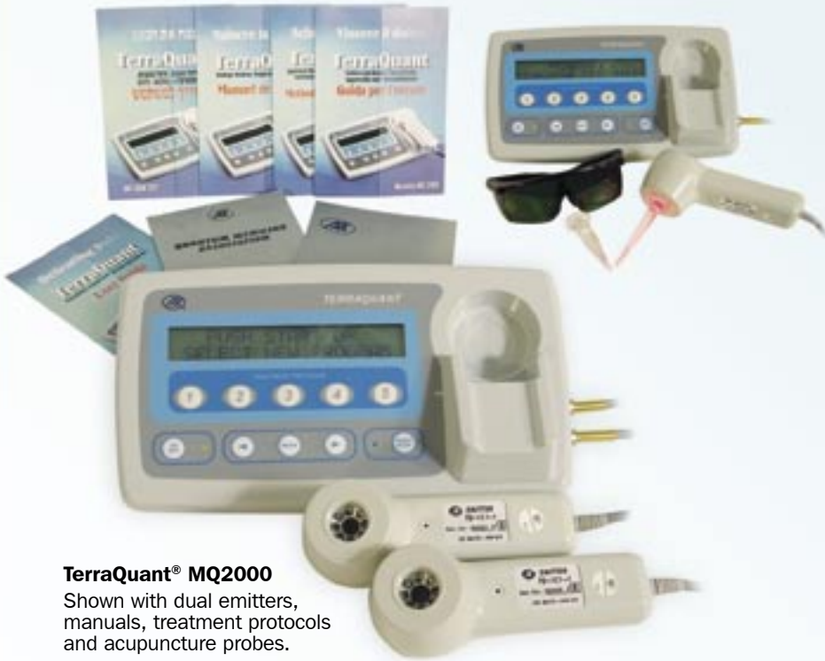
TerraQuant® MQ2000 Shown with dual emitters, manuals, treatment protocols and acupuncture probes.